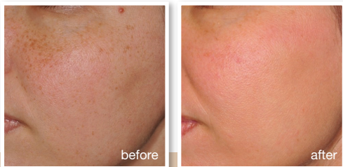
Pigmentation and freckles treatment