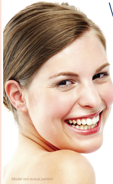
Model not actual patient

A fast "lunch-time" treatment with no downtime