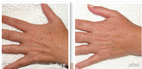
Age/sun spot treatment