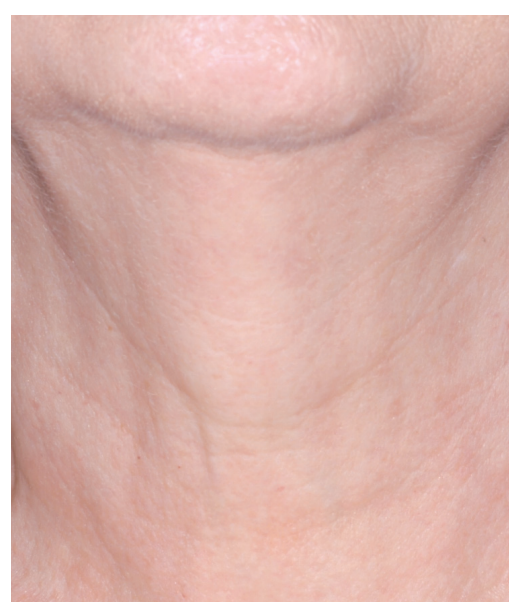
AFTER 8 WEEKS**