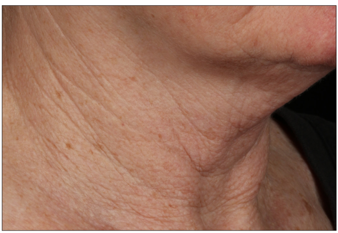
AFTER 12 WEEKS*