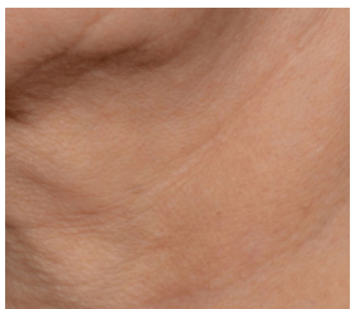
AFTER 12 WEEKS*