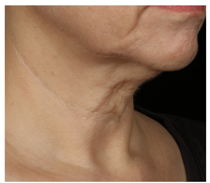
AFTER 12 WEEKS*