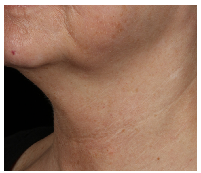
AFTER 12 WEEKS*